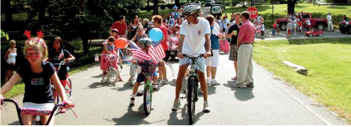
The annual Oak Hill parade kicks off with a host of participants.