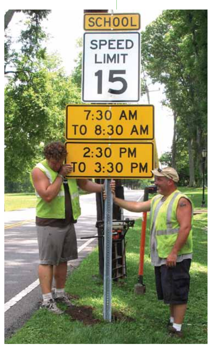
New school zone signs installed by Jackaroo New signs mark the expanded school zones for Glendale and Oak Hill schools approved by the Board of Commissioners. Streets affected include Robertson Academy Road, Tyne Boulevard, Thompson Avenue, Oak Valley Lane, and General Bate, Crestridge, Overbrook, Melville, and Churchwood drives.

The new company will provide all engineering services for the city over the next several years beginning October 1.