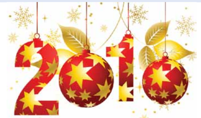
Happy Holidays from the City of Oak Hill

Presorted First Class Mail U.S. Postage PAID Nashville, TN Permit #3731