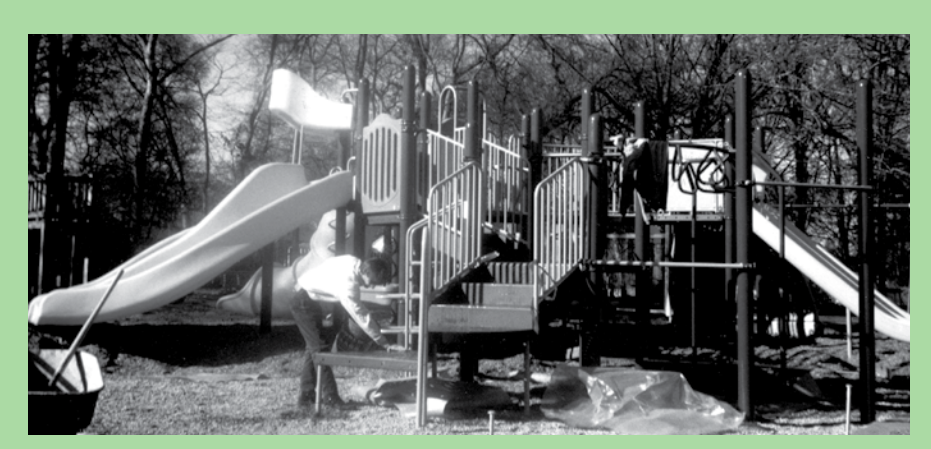
A worker puts the finishing touches on the new playground at Glendale Elementary School, 800 Thompson Avenue, which will be available for neighborhood use after February 1.