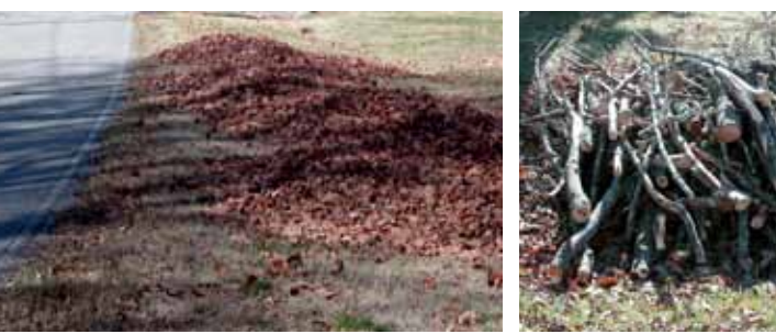
side of the road to be Correct placement of leaves, brush