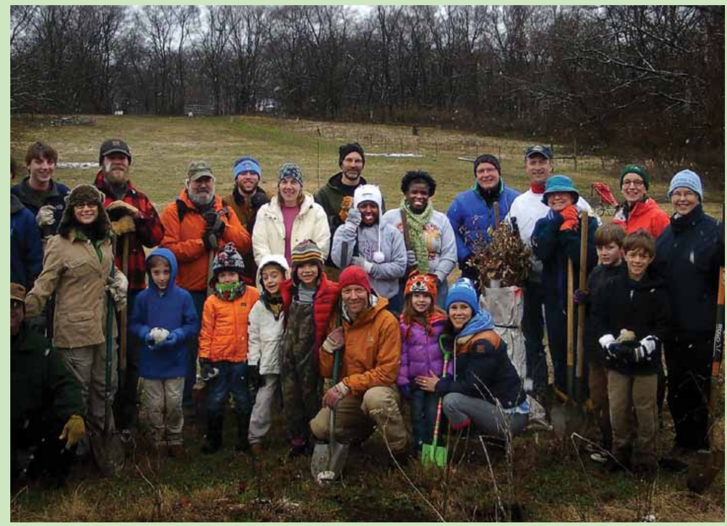
In just over two hours on Saturday, March 2, the Land Trust for Tennessee's Glen Leven Farm planted 300 new seedlings with the help of 22 volunteers, including seven children. To participate in future volunteer activities at Glen Leven Farm, visit LandTrustTN.org.