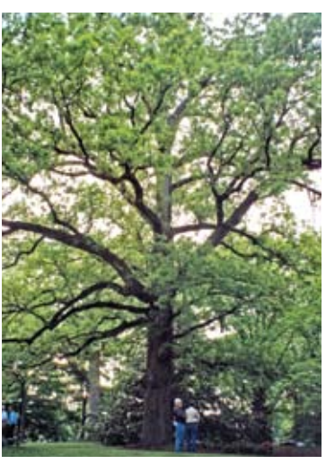
The winning tree from 2004 is on Stonewall Drive in Oak Hill.

One of the added services that might result from this program would be increased enforcement of non-solicitation laws regarding door-to-door salespersons in Oak Hill neighborhoods.