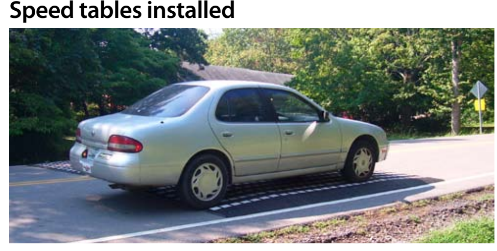
Speed tables on two test streets have been enthusiastically received. See page 3.

This orientation is limited to Father Ryan students, staff, and parents and Oak Hill residents only.