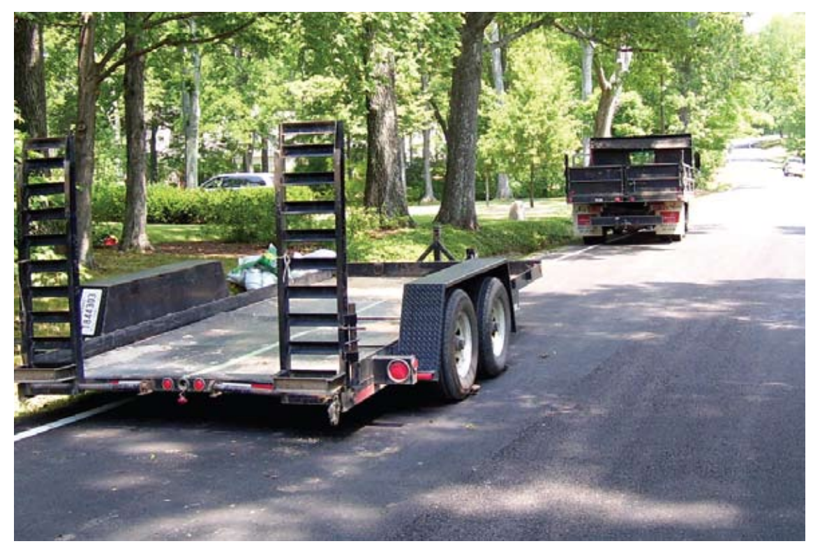
Oak Hill has a long-standing ordinance against street parking.